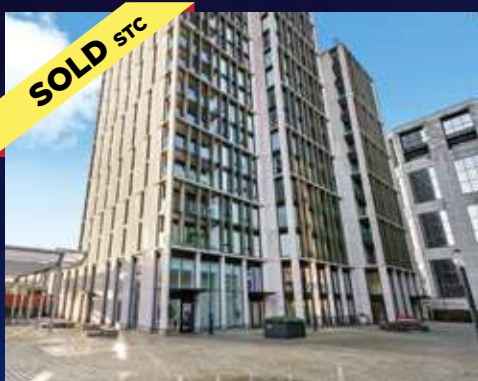
Harrow Town Centre